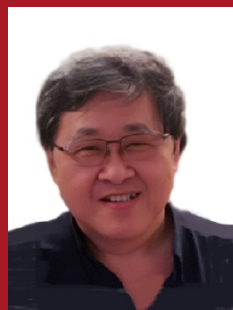
Heng PS (based in Malaysia)

Strategic transformation, product planning, leadership expertise